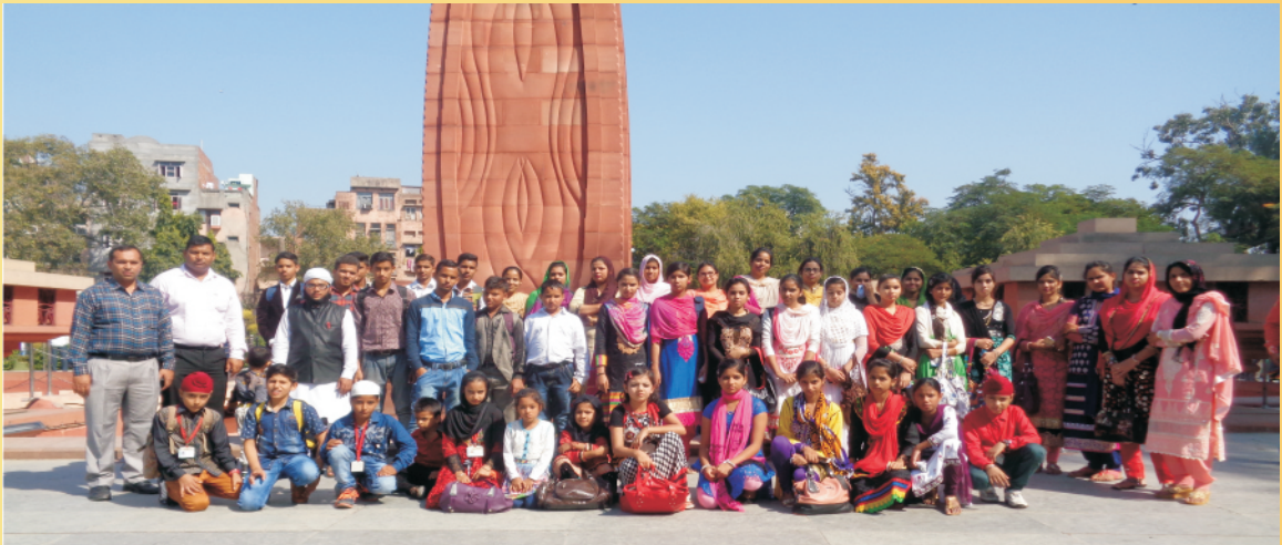
EDUCATIONAL TOUR OF JALLIAN WALA BAGH AND GOLDEN TEMPLE AMRITSAR